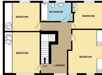
1ST FLOOR 688 sq.ft. (63.9 sq.m.) approx.