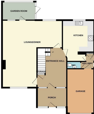
GROUND FLOOR 959 sq.ft. (89.1 sq.m.) approx.